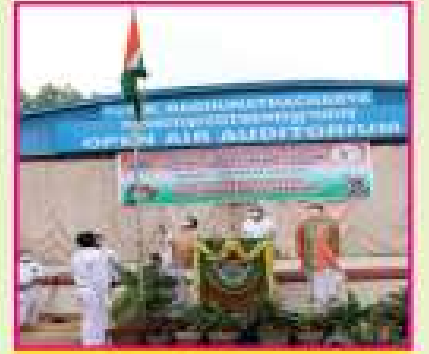
ध्वजारोहणं कुर्वन्तः, मान्दाः, कुलपतयः

अतः प्रत्येकं कर्मचारिणः दायित्वं वर्तते यत् विश्वविद्यालयकारणेन अस्माकं जीवनं प्रवर्तते इति हेतोः विश्वविद्यालयस्य सर्वोद्गोपनिकामे अहर्निशं प्रशंसो विधेयः इति ।