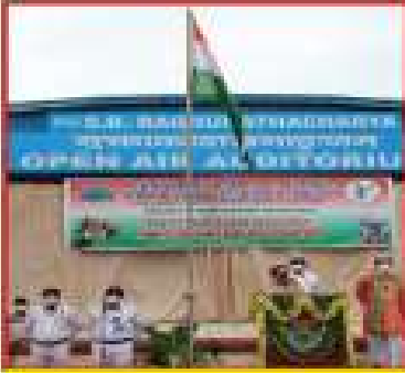
सार्धम् उद्घोषयन्तः मान्याः कुलपतयः