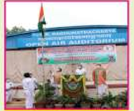
ध्वजारोहणं कुर्वन्तः मान्याः कुलपतयः

अतः प्रत्येकं कर्मचारिणः दायित्वं वर्तते यत् विश्वविद्यालयकारणेन अस्माकं जीवनं प्रवर्तते इति हेतोः विश्वविद्यालयस्य सर्वोद्गोपनिकामे अहर्निशं प्रशंसां विधेयः इति ।