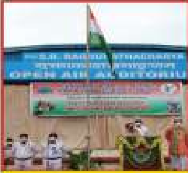
सार्धम् उद्घोषयन्तः, मान्दाः, कुलपतयः