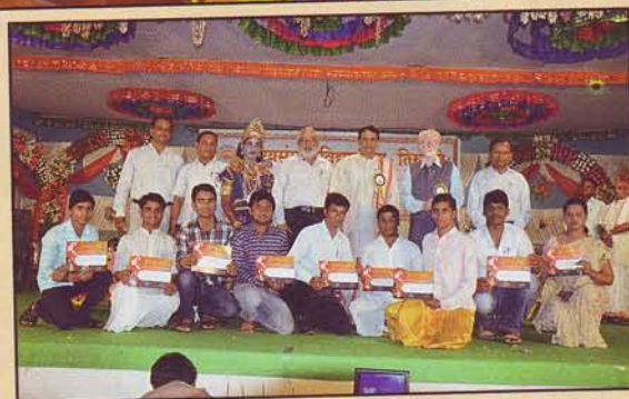
Academic Champions with VC and Registrar