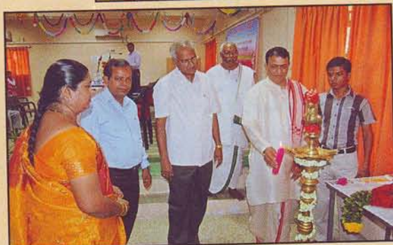
Inauguration of Hindi Seminar