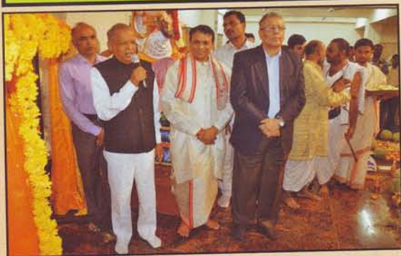
Foundation laid by Hon'ble Chancellor for Heritage corridor