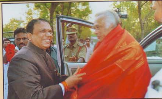
Minister is being welcomed by VC