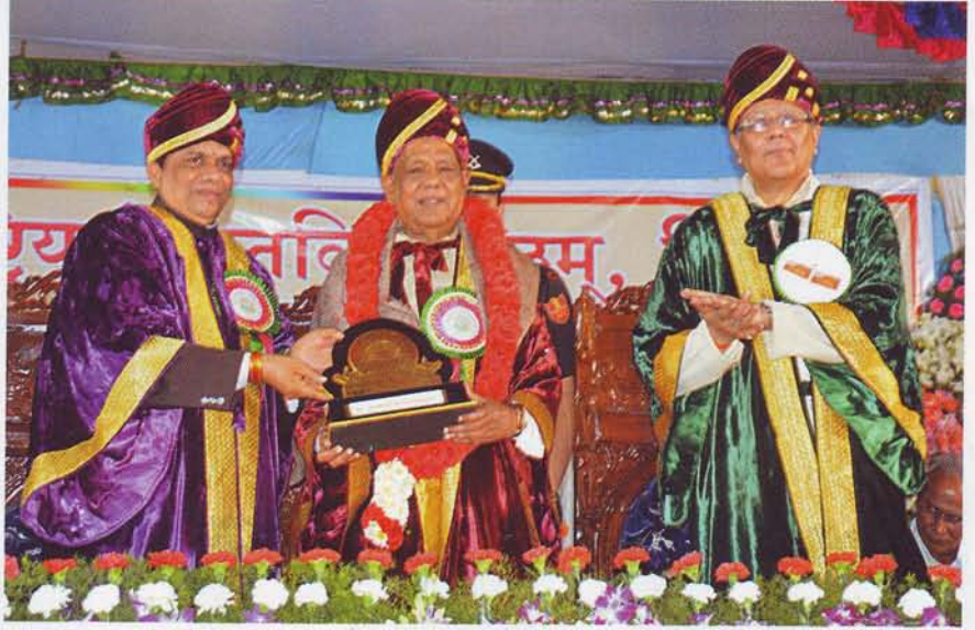
Prajnana vachaspati Dr. Janaki Ballav Patnaik, Hon'ble Governor of Assam and Chancellor is being felicitated by Vice-Chancellor. Justice Mukundakam Sharma, Chancellor, SLBSRSVidyapeetha, New Delhi is at left.

Let us, this day, invoke for our protection the Lord of Speech, the Creator of all, who is swift as thought; may He, the Bestower of all happiness, the doer of good works, be propitiated by all our oblations, (so as) to grant us his protection. (Rgveda 10.81.7)