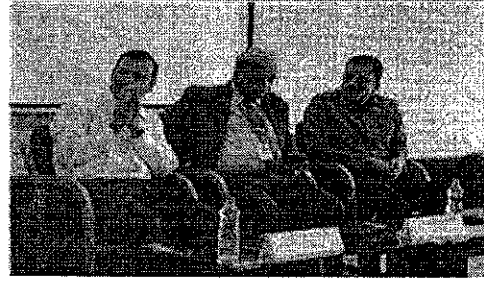
Looking back only to leap forward: A memoir of few initiatives of CEERA dealing with Law of Contracts